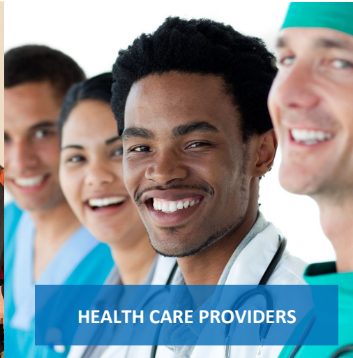
HEALTH CARE PROVIDERS